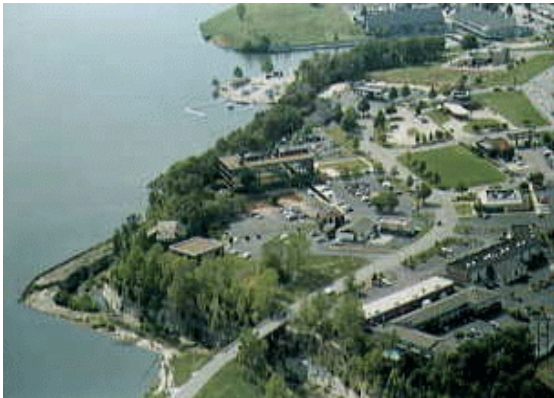
Lake St. Louis - St. Charles County, MO

As forest, grasslands, and wetlands are increasingly being converted to parking lots, rooftops and roads, we are reducing our environments ability to soak up rainfall (and snow-melt). This decrease in infiltration is a double-edged sword. First, less infiltration means more water stays on the surface. Secondly, less soil-water contact equates to less water being stored in the soil. Both of these factors translate to more water moving as runoff from a given area. (To simplify things, we'll use the term runoff to refer to water that is moving both across the surface and through the soil.)