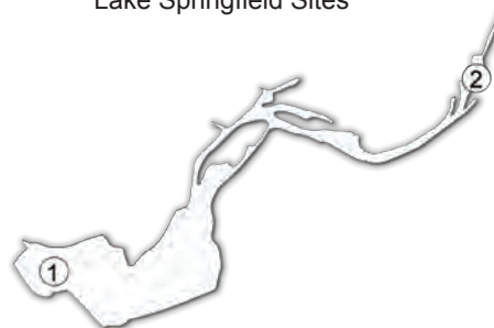
Lake Springfield Sites

The shift in water quality across Lake Springfield's two sites is interesting in that it differs from the norm. Missouri lakes tend to have lower levels of nutrients and inorganic suspended sediment near the dam compared to up-lake sites due to sedimentation. In Lake Springfield we find higher phosphorus and inorganic suspended sediment at Site 1. Interestingly, nitrogen concentrations were very similar on sample dates for the two sites (though variable from sample to sample).