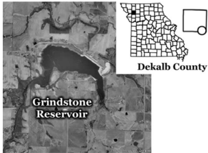
Location of Grindstone Reservoir

Grindstone Reservoir is located about 4 miles northwest of Cameron. The very large watershed of this 180 acre reservoir covers 13,417 acres and is dominated by agricultural land use (55%). The large ratio of watershed size to lake volume reduces the reservoir's ability to process the nonpoint source inputs.